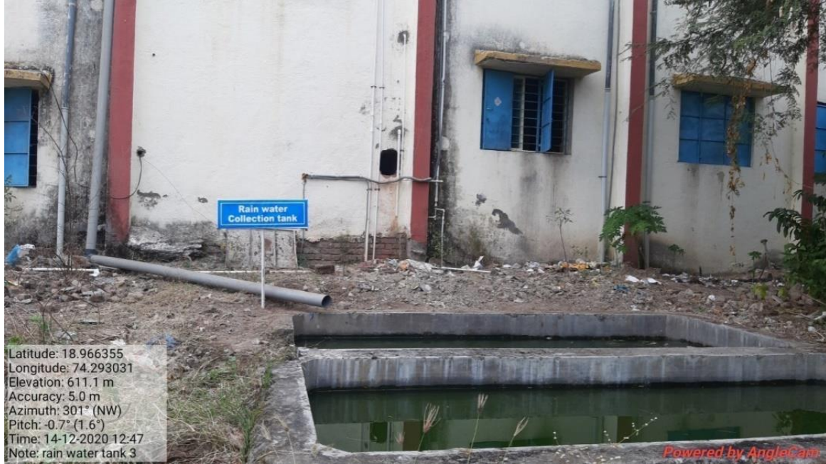
Photograph of Pipe channel system for Rain Water harvesting with tank