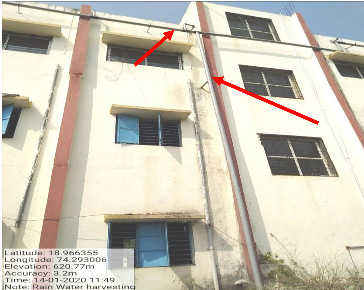
Photograph of Pipe Channel System for Rain Water Harvesting